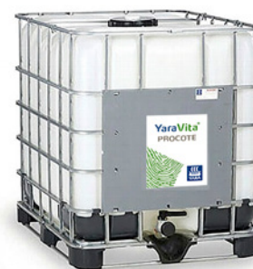
Delivered to retailers as liquid coating

Yara North America, Inc. 800-234-9376 www.yara.us