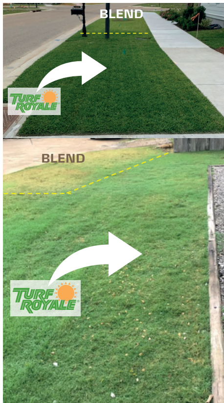
Rate 1lb.N/1000Ft<sup>2</sup> Compared against standard blends